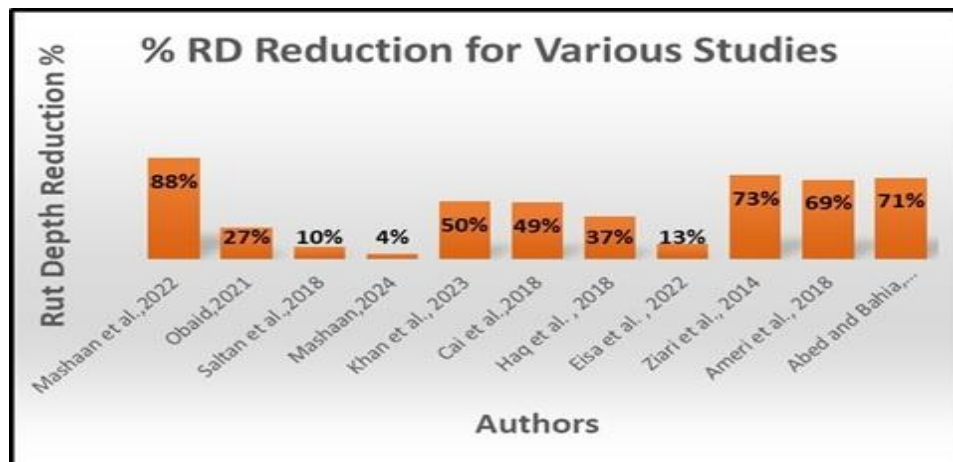
Fig. 1: Rutting Depth Reduction in Nanomaterial Modified Asphalt Mixtures