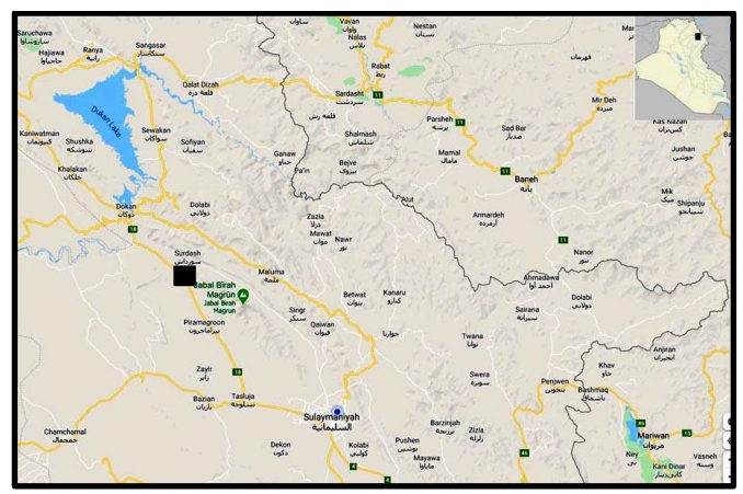
Figure 1: Location of the study area (marked with black square) in Sulaimani Province, Kurdistan Region-Iraq.

from the north, Yakhian Mountains from the east, Bardazaro Mountain from the south and by Qashan Mountain from the west (Fig. 1).